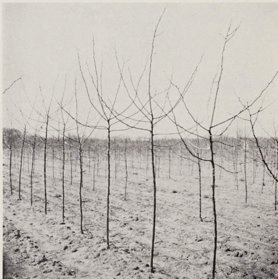
Cole's Selected, Budded Thornless Honeylocust. Full, strongly-branched heads and straight stems which need no staking.